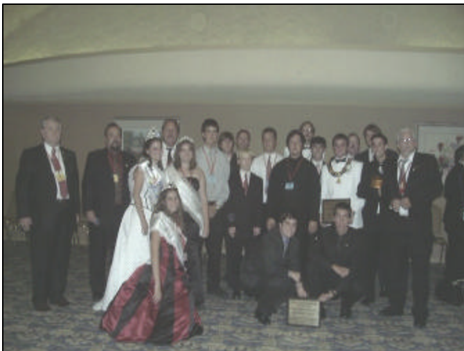
And Chapter of the Year goes to...WALT DISNEY!